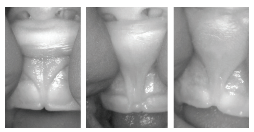
Lip-ties come in different shapes and sizes, thick or thin, and some even cause bone notching.

will make clicking noises, reflux may be present, and the mother may experience discomfort.